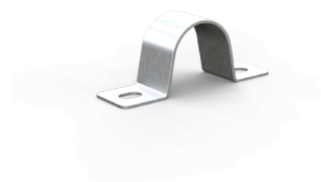
Accessory Clamp 28 mm