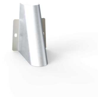
Foot 28 mm