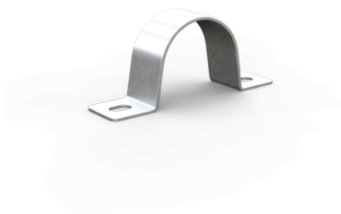
Clamp 28 mm