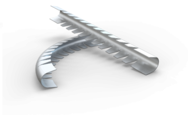
Flexible Bend 28 mm