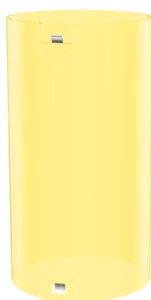
Coupling with clip 40 mm