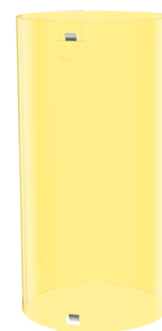
Coupling with clip 50 mm