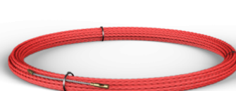
Cable puller STCX 20 m