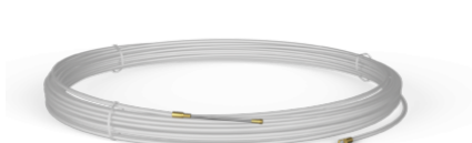
Cable drawer MON 20 m