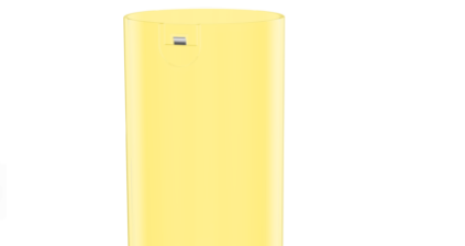
Coupling with clip 40 mm