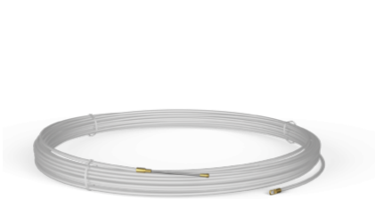
Cable drawer MON3 5 m