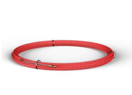
Cable puller STCX 10 m