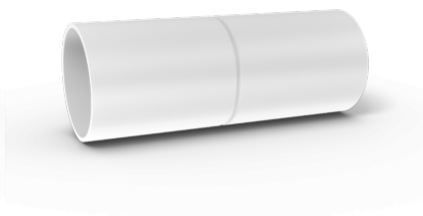
HF Coupling 32 mm