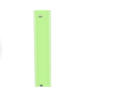
Coupling with clip 32 mm