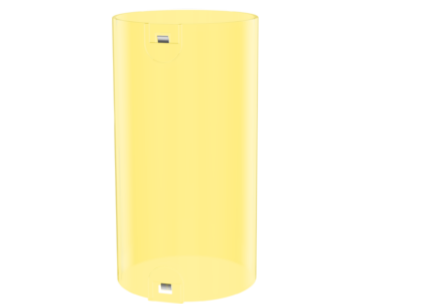
Coupling with clip 40 mm