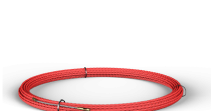
Cable puller STCX 20 m