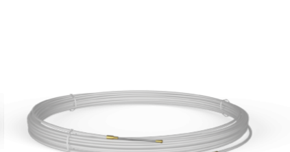
Cable drawer MON 5 m