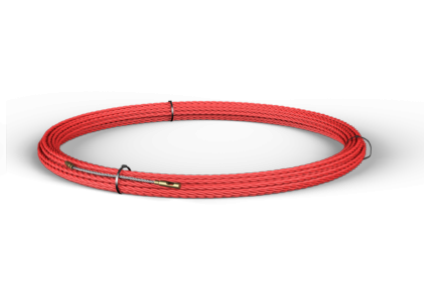
Cable puller STCX 10 m