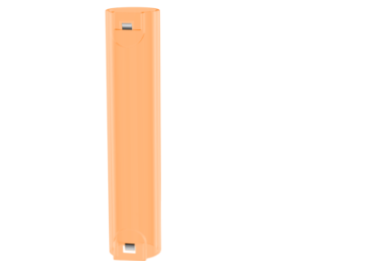
Coupling with clip 25 mm