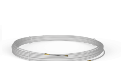
Cable drawer MON3 30 m