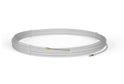
Cable drawer MON 15 m