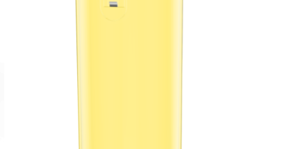
Coupling with clip 50 mm