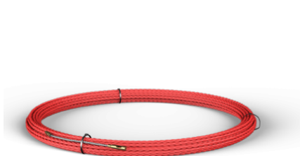
Cable puller STCX 15 m